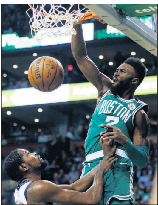
Boston Celtics' Jaylen Brown (7) dunks over Golden State Warriors' Kevin Durant during the first quarter of Thursday's game in Boston.

Playing his second game since suffering a facial fracture, Irving shed his protective mask in the second quarter. Then, with the game tied at 88, he was fouled on his layup attempt and calmly made a pair of free throws. Durant then came up empty