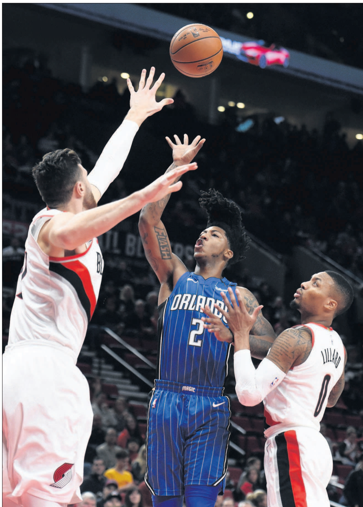
Orlando Magic guard Elfrid Payton, center, shoots the ball over Portland Trail Blazers center Jusuf Nurkic, left, and guard Damian Lillard, right, during the first half of Wednesday's game in Portland.

Portland overcomes slow start to earn second straight win