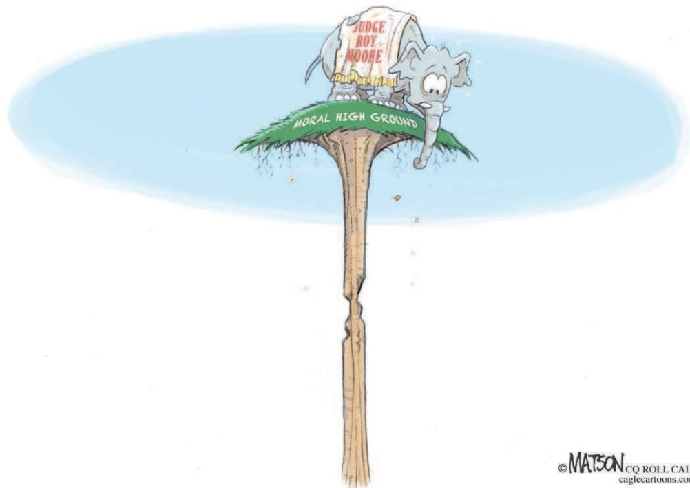
MATSON CO. ROLL CALL.