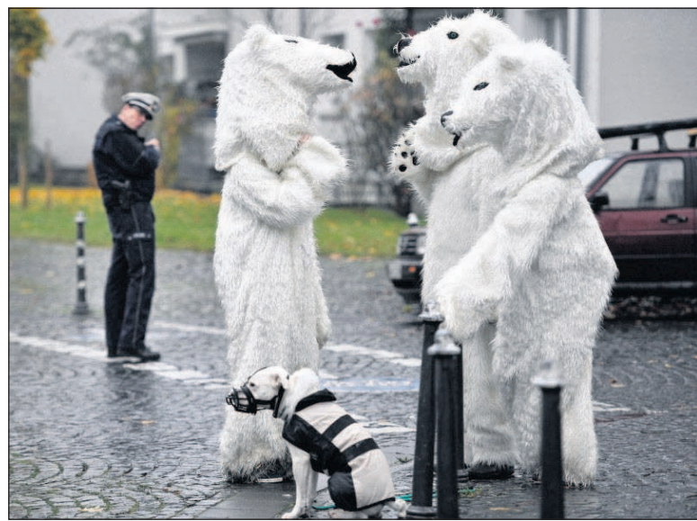
Protestors dressed as polar bears are watched by a police officer as they talk in a backstreet after a demonstration outside the COP 23 Fiji UN Climate Change Conference in Bonn, Germany, Saturday.