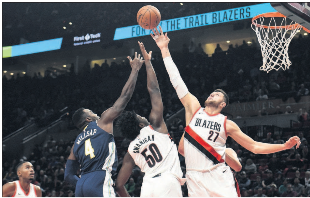
Denver Nuggets forward Paul Millsap, left, and Portland Trail Blazers forward Caleb Swanigan, center, and center Jusuf Nurkic reach for a rebound during the first half of an NBA basketball game in Portland on Monday.

Nurkic, who played just one minute in the fourth quarter of Friday night's loss to Brooklyn, played for the