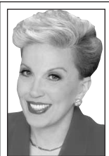
JEANNE PHILLIPS Advice