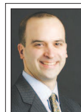
DAVID LEONHARDT Comment