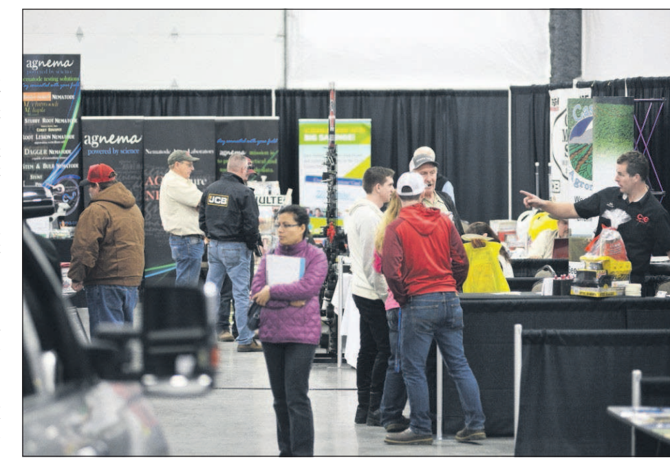
The Hermiston Farm Fair was held at the Eastern Oregon Trade and Event Center for the first time in December 2016.