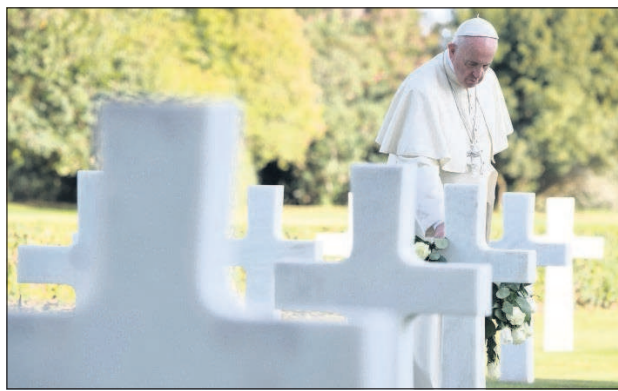
Pope Francis pays a visit to the American military cemetery in Nettuno, Italy, Thursday. Pope Francis is underlining the price of war, visiting an American military cemetery and the site of a Nazi massacre in Rome.

NETTUNO, Italy (AP) — Pope Francis called war "the destruction of ourselves" during visits Thursday to an American military cemetery and the site of a Nazi massacre in Rome as he marked the Catholic All Souls' Day commemorating the dead.