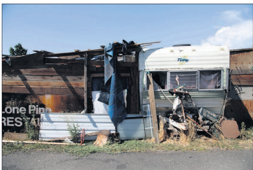
This 2014 file photo shows one of the Native American homes at the Lone Pine fishing site near The Dalles.