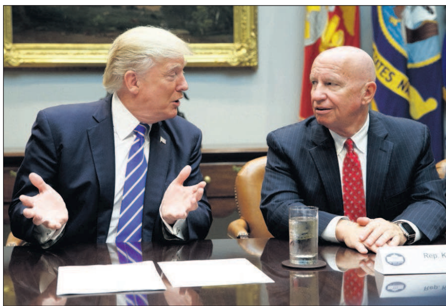
In this Sept. 26 photo, Rep. Kevin Brady, R-Texas, right, listens as President Donald Trump speaks during a meeting with members of the House Ways and Means committee in the Roosevelt Room of the White House in Washington.

An Associated Press-NORC poll released Wednesday found most Americans saying Trump's tax plan would benefit the wealthy and corporations, and less than half believing his message that "massive tax cuts" would help middle-class workers.