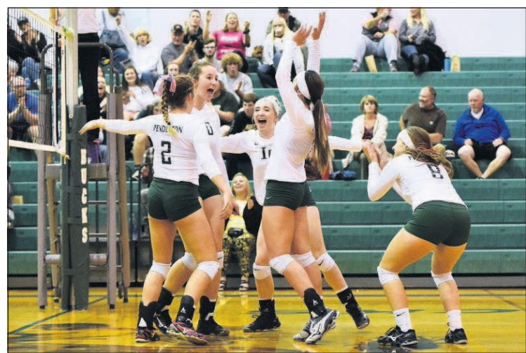
Pendleton Buckaroo players celebrate after defeating the Hillsboro Spartans 3-1 on Tuesday in Pendleton.

Pendleton (15-6) shot out of the gates and showed it was the better team on the court with two quick set wins 25-16 and 25-7, putting See BUCKAROOS/2B