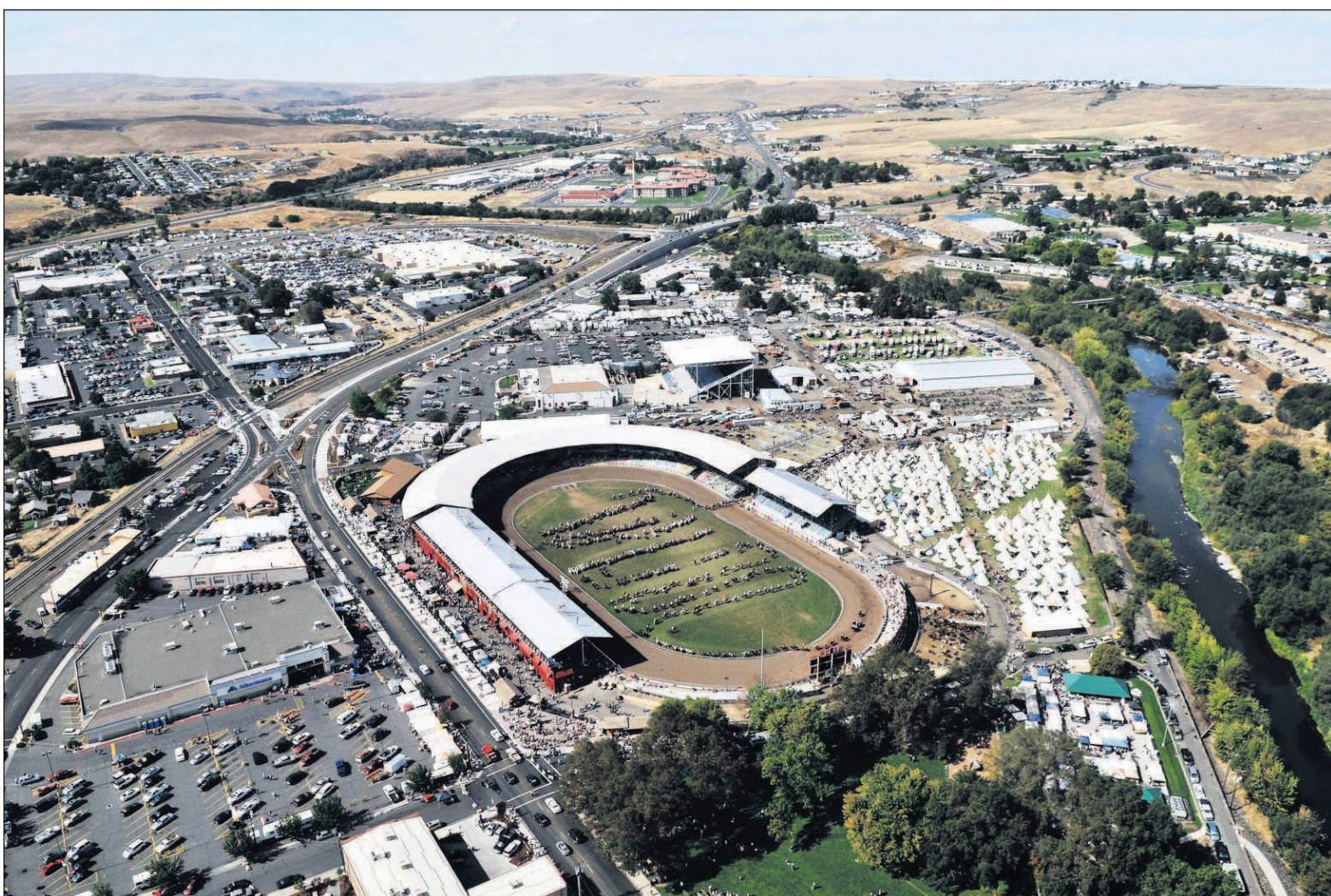
A serpentine of riders carrying U.S. flags makes its way across the Pendleton Round-Up Arena at the end of the Westward Ho! Parade during the 100th Anniversary of the Round-Up on Sept., 17, 2010.