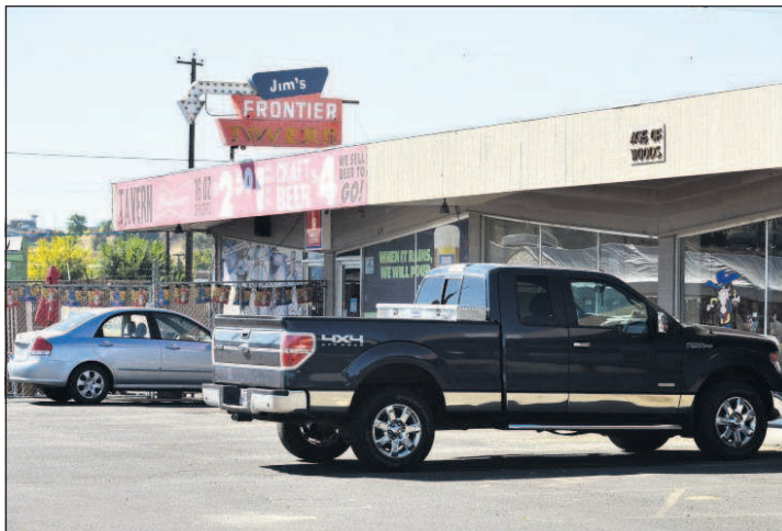
The storefront building housing Jim's Frontier Tavern has been purchased by the Pendleton Round-Up Association.