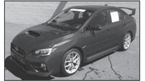
2018 Subaru Sti Launch Edition SAP170303 - JF1VA2W64F9805343

$28,890 or $349 mo. Payment based on 84 months at 3.75% APR with $3,000 down, plus tax title license and doc fee.