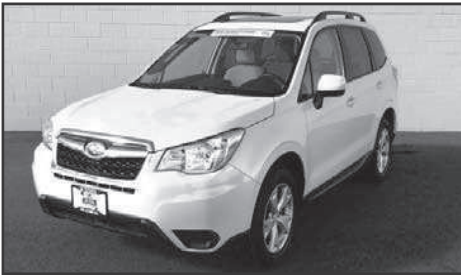
2016 Subaru Forester 2.5i Premium SEH170391 - JF2SJADC2GH537269

$20,990 or $244 mo. Payment based on 84 months at 3.75% APR with $3,000 down, plus tax title license and doc fee.