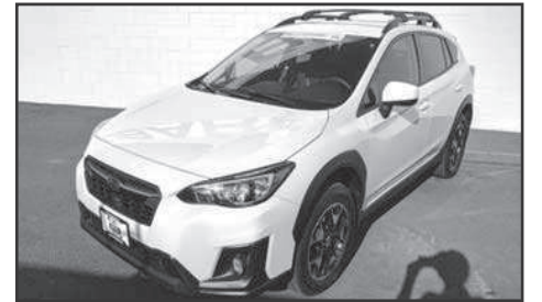
2018 Subaru Crosstrek 2.0i Premium SRQ170718 - JF2GTABC9J9200876

$24,490 or $289 mo. Payment based on 84 months at 3.75% APR with $3,000 down, plus tax title license and doc fee.