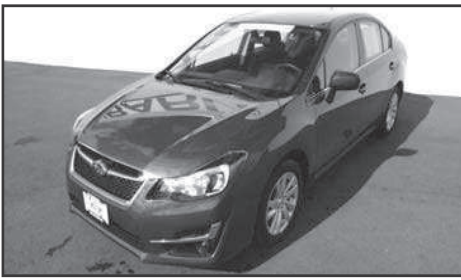
2016 Subaru Impreza 2.0i Premium SAP170664 - JF1GJAB69GH015570

Get 0.99% APR Financing* and fall in love with a Certified Pre-Owned Subaru. Offer ends October 31.