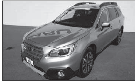
2015 Subaru Outback 3.6R Limited STN170688 - 4S4BSEJC7F3206427

$26,990 or $324 mo. Payment based on 84 months at 3.75% APR with $3,000 down, plus tax title license and doc fee.