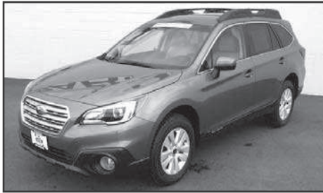
2016 Subaru Outback 2.5i Premium SAP170339 - 4S4BSACC1G3355696

$25,490 or $305 mo. Payment based on 84 months at 3.75% APR with $3,000 down, plus tax title license and doc fee.