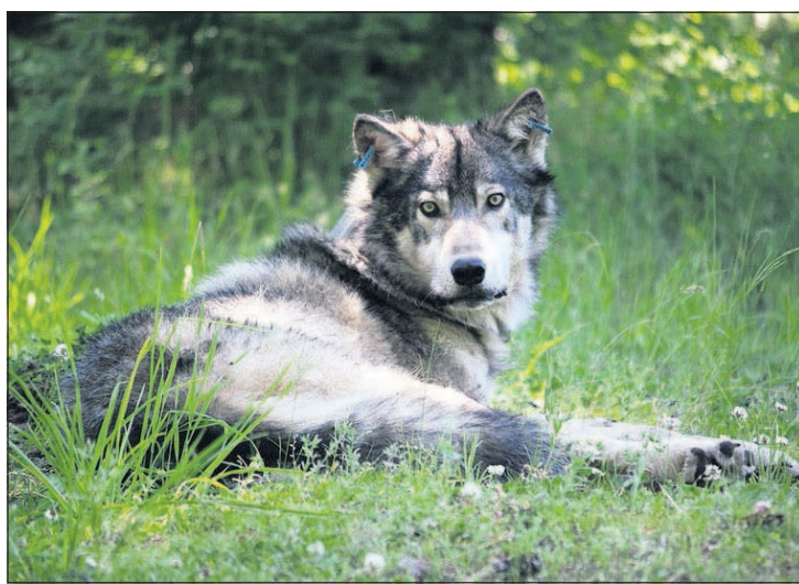
The wolf designated as OR14 was captured and GPS-collared by the Oregon Department of Fish and Wildlife in the Weston Mountain area north of the Umatilla River on June 20, 2012. OR14 weighed 90 pounds and was estimated to be at least 6 years old.

In effect, these groups are saying that wolves, coyotes and other native wildlife do not have a "right" to live on public lands