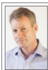
TIMOTHY EGAN Comment

Timothy Egan worked for 18 years as a writer for The New York Times, first as the Pacific Northwest correspondent, then as a national enterprise reporter.