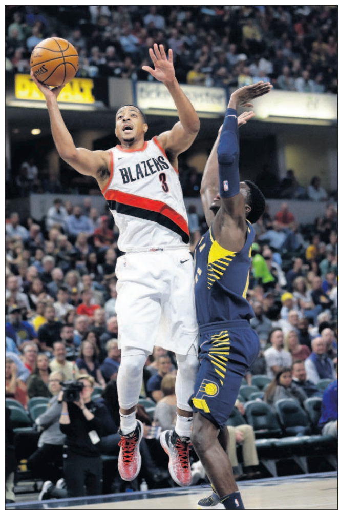
Portland Trail Blazers guard CJ McCollum shoots over Indiana Pacers guard Victor Oladipo during the second half of an NBA basketball game in Indianapolis, Friday.

Pacers: Indiana plays Saturday at Miami. The Heat have won their last five regular-season home games over the Pacers and 11 of 12 dating to 2010-2011.