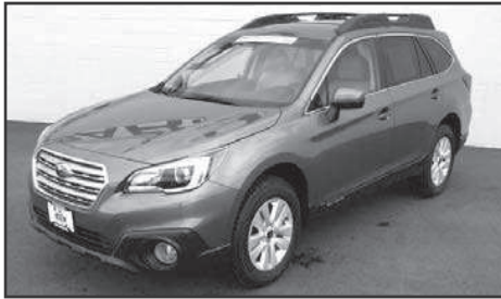
2016 Subaru Outback 2.5I Premium SAP170339 - 4S4BSACC1G3355696

$25,490 or $305 mo. Payment based on 84 months at 3.75% APR with $3,000 down, plus tax title license and doc fee.