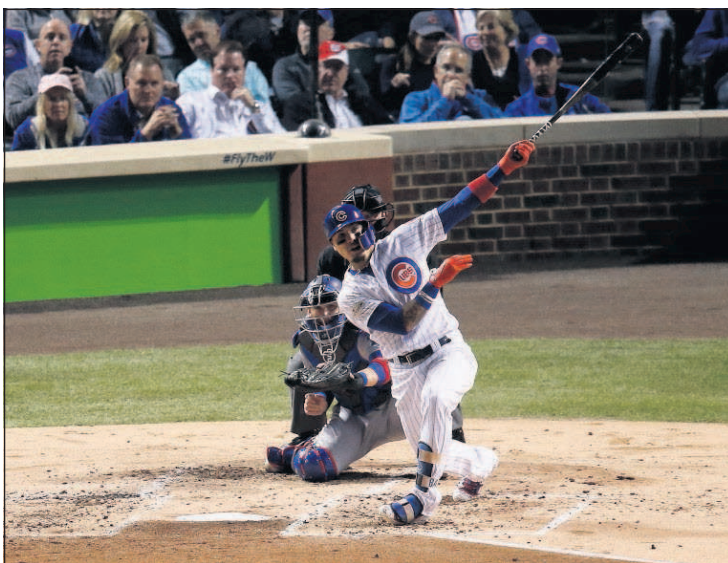
Chicago Cubs' Javier Baez watches his home run during the second inning of Game 4 of the National League Championship Series against the Los Angeles Dodgers Wednesday in Chicago.