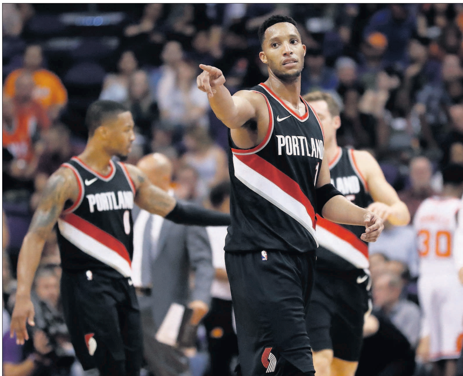
Portland Trail Blazers guard Evan Turner (1) points after a basket during the second half of an NBA basketball game against the Phoenix Suns, Wednesday in Phoenix.