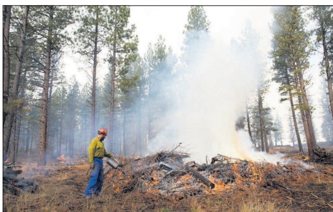
This 2013 photo provided by the Deschutes Collaborative Forest Project shows an unidentified worker burning a pile of collected undergrowth in the Deschutes National Forest. The thinning of forests in central Oregon has saved homes amid one of the most devastating wildfire seasons in the American West.

But it also highlights the challenges of replicating the