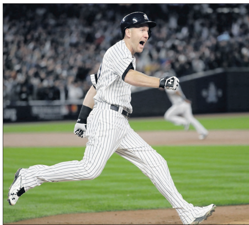
New York Yankees' Todd Frazier reacts after hitting a home run during the second inning of Game 3 of baseball's American League Championship Series against the Houston Astros on Monday in New York.