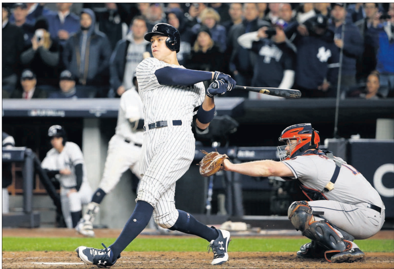
New York Yankees' Aaron Judge hits a three-run home run during the fourth inning of Game 3 of baseball's American League Championship Series against the Houston Astros Monday in New York.