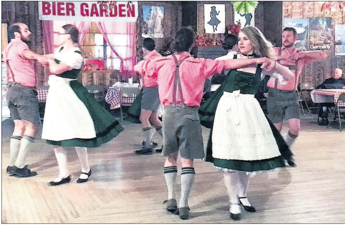
The Tirolean Dancers of Oregon perform an authentic Alpine folk dance at Oregon's Alpenfest. The Swiss-Bavarian festival is held each fall in Wallowa County.

Performances at Wallowa Lake's Edelweiss Inn featured returning favorites The Polkatones dance band, the Tirolean Dancers of Oregon folk