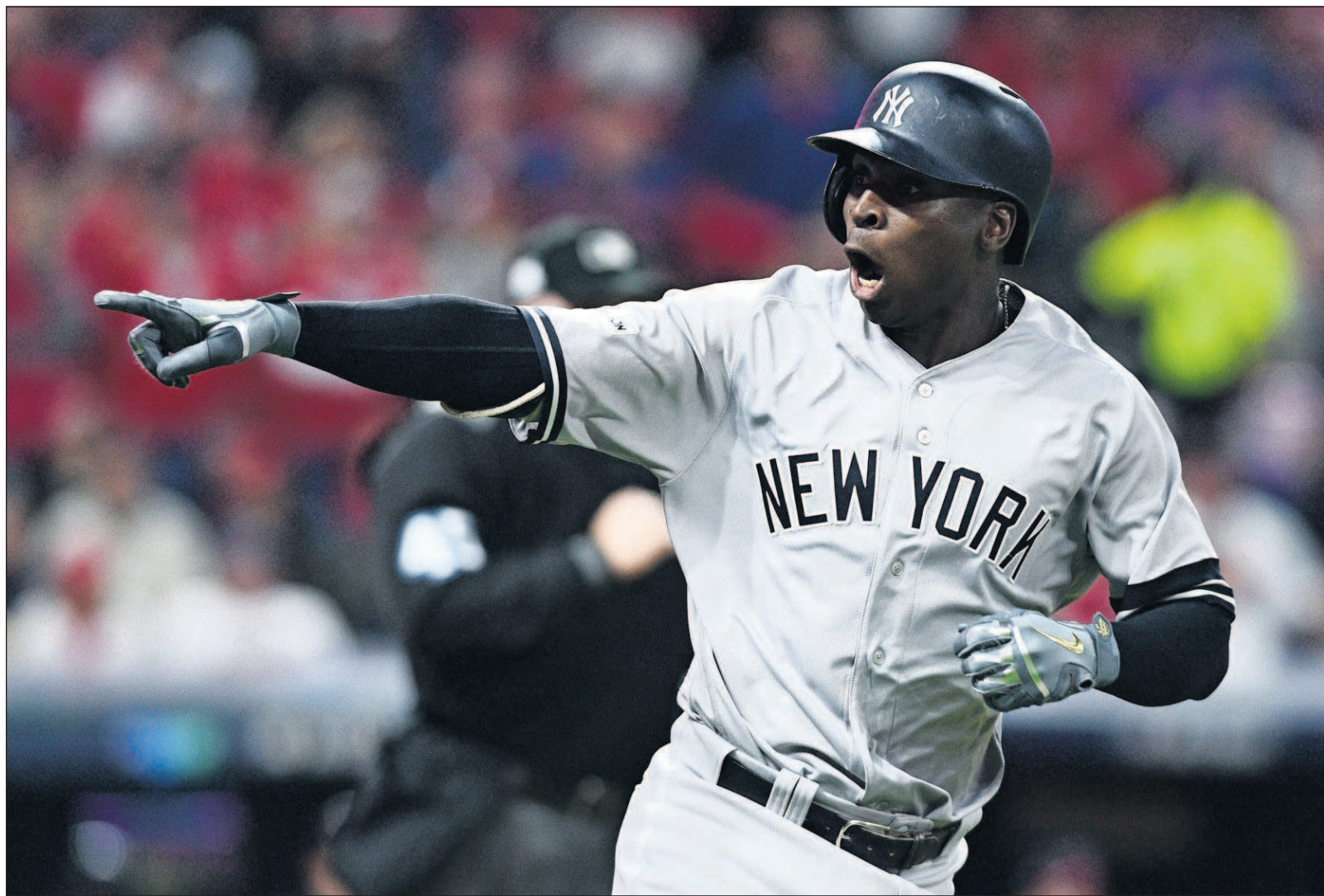
New York Yankees' Didi Gregorius points to the dugout after hitting a two-run home run off Cleveland Indians starting pitcher Corey Kluber during the third inning of Game 5 of a baseball American League Division Series, Wednesday in Cleveland.