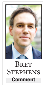
BRET STEPHENS Comment

Then there are the endless liberal errors of fact. There is no "gun-show loophole" per se; it's a private-sale loophole, in other words the right to sell your own stuff. The civilian AR-15 is not a true "assault rifle," and banning such rifles would have little effect on the overall murder rate, since most homicides are committed with handguns. It's not true that 40 percent of gun owners buy without a background check; the real number is closer to