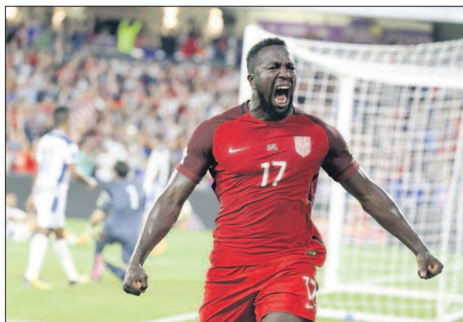
United States' Jozy Altidore celebrates in front of fans after scoring a goal against Panama during the first half of a World Cup qualifying soccer match, Friday in Orlando, Fla.