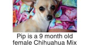
Pip is a 9 month old female Chihuahua Mix

is right here in the Classifieds! Check our real estate listings.