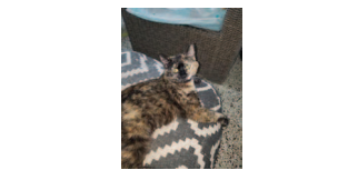
Ella is a 1 year old female Domestic Shorthair mix

Guardian pups Pyrenees Akbash $175.00, 14 weeks. Pyrenees males, 6 weeks, $275.00. With goats, alpacas. Prosser. 503-467-8693.