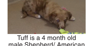
Tuff is a 4 month old male Shepherd/ American Blue Heeler

Available for adoption at PAWS 517 SE 3rd St.