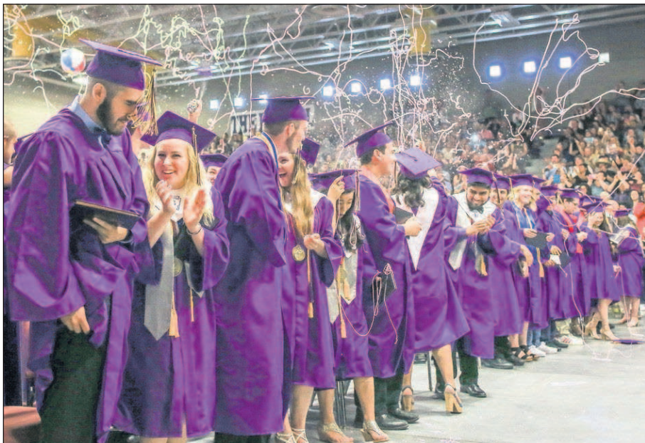
Members of the 2017 Hermiston High School graduating class celebrate at the end of last year's graduation ceremony in the high school gym.