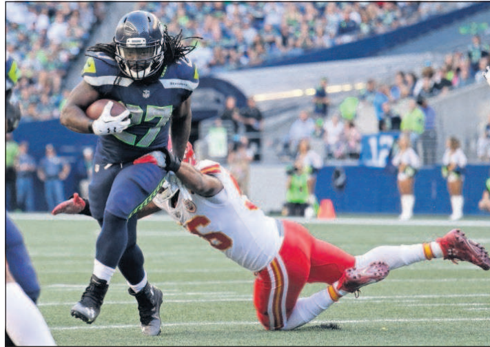
Seattle Seahawks running back Eddie Lacy, left, breaks a tackle by Kansas City Chiefs inside linebacker Derrick Johnson, right, during a preseason game on Aug. 25 in Seattle.

"I thought I would be back there, I was there for four years and I thought it would continue," Lacy said Thursday. "Sometimes it doesn't work out like that. Sometimes a change of scenery isn't bad."