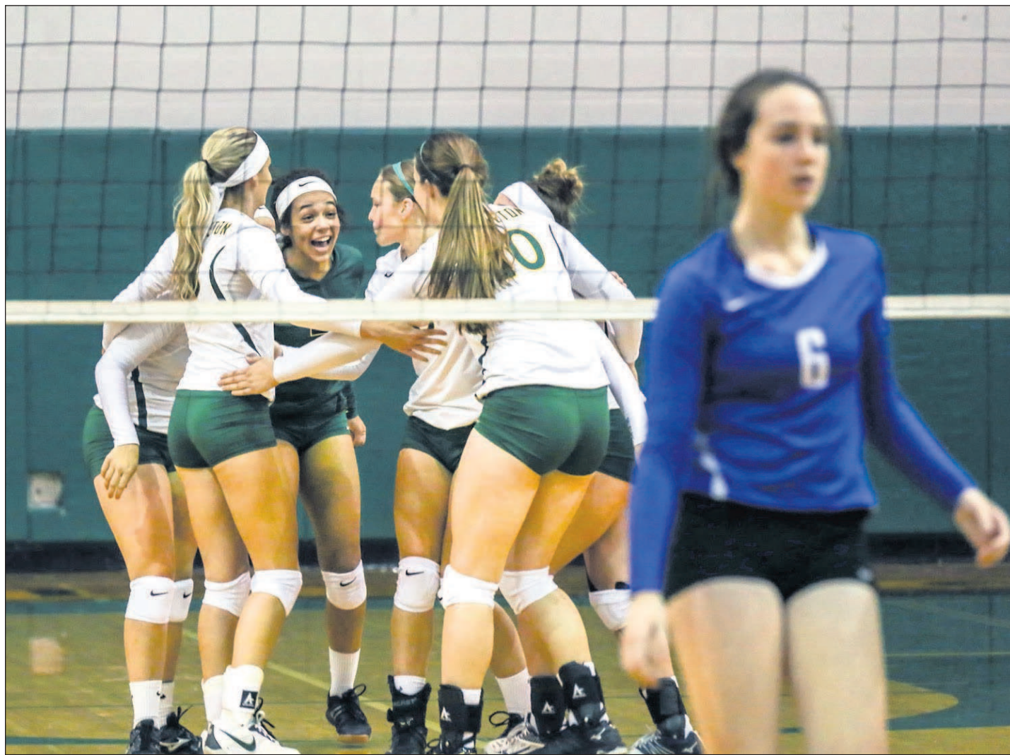
Pendleton players celebrate after winning a long volley against La Grande during Thursday's 3-0 win over the Tigers.