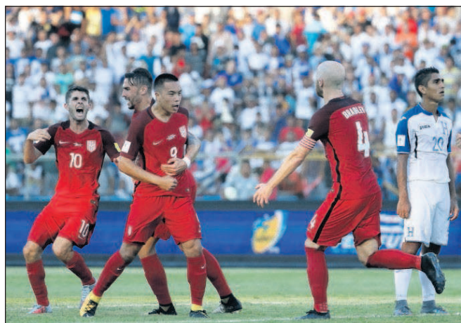
United States' Bobby Wood, 9, celebrates with teammates after scoring his team's first goal during a 2018 World Cup qualifying soccer match against Honduras in San Pedro Sula, Honduras on Tuesday.