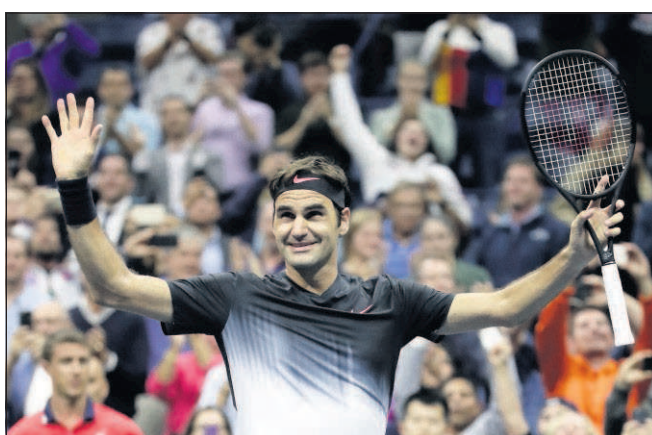
Roger Federer, of Switzerland, celebrates after defeating Frances Tiafoe, of the United States, at the U.S. Open tennis tournament, Tuesday in New York.

Federer's initial match point came at 5-3, 40-30, but Tiafoe staved that off, then broke. He produced a