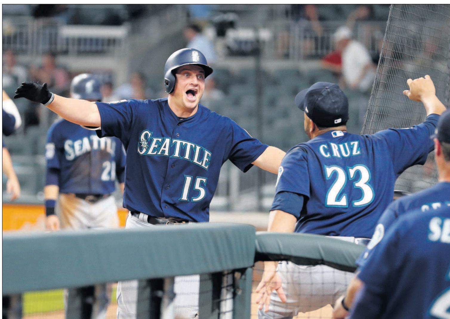
Seattle Mariners' Kyle Seager (15) celebrates with Nelson Cruz (23) after hitting a three-run home run in the eighth inning of a baseball game against the Atlanta Braves Wednesday in Atlanta.