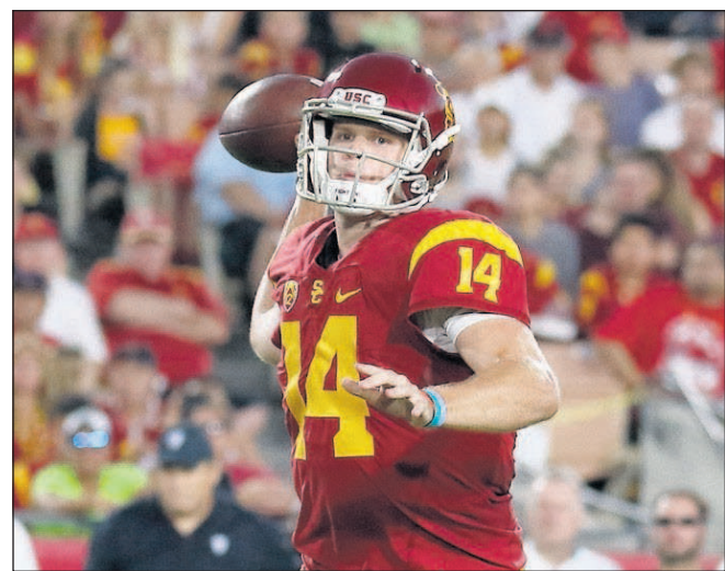
In this Oct. 1, 2016, file photo, Southern California quarterback Sam Darnold (14) throws a touchdown pass to wide receiver JuJu Smith-Schuster (9) during the first half of an NCAA college football game in Los Angeles.

He threw for 3,430 yards and tied a Pac-12 record with 43 touchdown passes to earn the league's offensive See PAC-12/3B