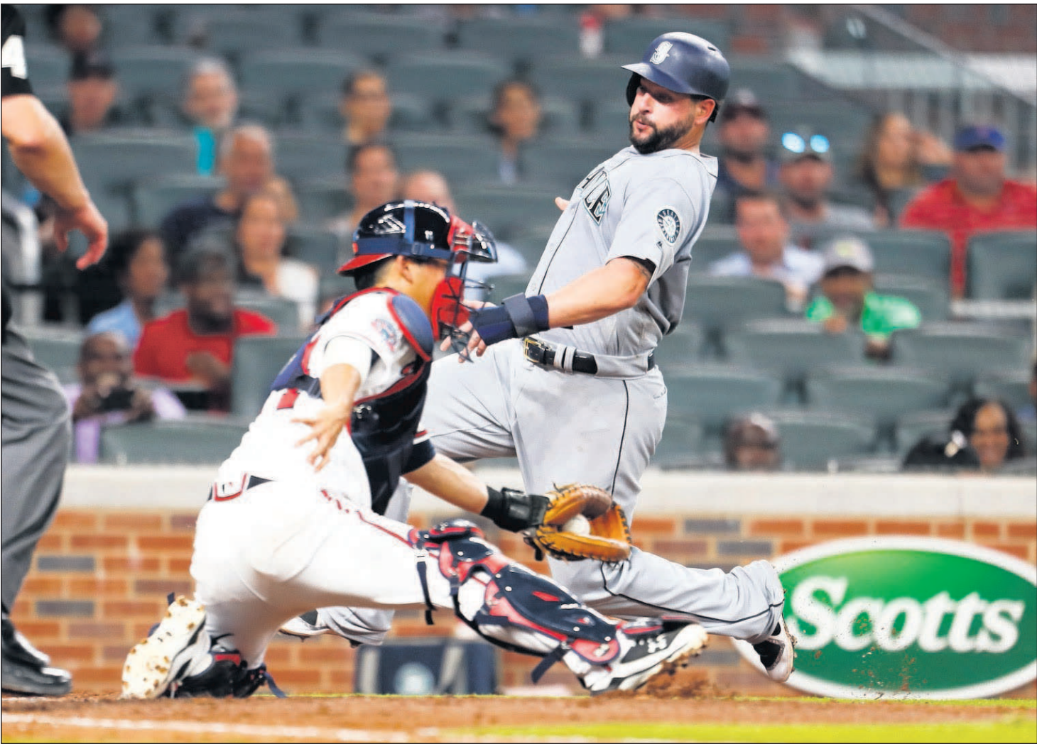
Seattle Mariners Yonder Alonso (10) avoids the tag of Atlanta Braves catcher Kurt Suzuki (24) at home to score in the fourth inning of a baseball game in Atlanta.