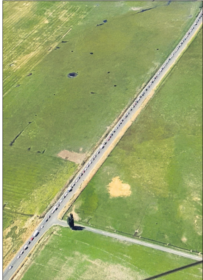
This aerial photo provided by the Oregon State Police shows a 15-mile traffic jam on Highway 26 heading in to Prineville on Thursday. Traffic is already a headache in central Oregon as thousands of people are arriving before Monday's total solar eclipse.

PORTLAND (AP) — Traffic is already a headache in central Oregon as thousands of people arrive before Monday's total solar eclipse. Traffic was backed up about 15 miles at one point on Thursday on U.S. Highway 26 near of Prineville, the last town before the turnoff for an eclipse-themed festival that's expected to attract 35,000 people in a remote area with narrow, one-lane roads. Drivers then had to contend with another 14 miles of traffic on local roads to the venue. A handful of gas stations in Bend and Prineville also ran out of fuel Wednesday before getting restocked. The scene echoed one on Wednesday night, when eclipse traffic first began to swell. Traffic backed up for 12 miles on the same stretch of road, doubling the drive time between the towns of Redmond and Prineville as an estimated 8,000 cars passed through. "The numbers of people who were coming in, we are beyond capacity really on that highway. Traffic is moving — it's not stopped — but it's taking a long time," said Peter Murphy, a spokesman for the Oregon Department of Transportation in central Oregon. Traffic officials reprogrammed traffic lights to provide more time on green lights on east-west routes. The Prineville police also closed