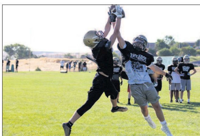
A pair of Pendleton Buckaroos battle for the ball while doing a passing drill during Wednesday's practice at Pendleton High School.