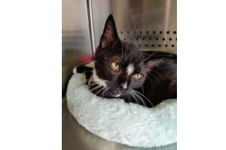
Peach is a 4 month old female Domestic Shorthair Mix

Available for adoption at PAWS 517 SE 3rd St.