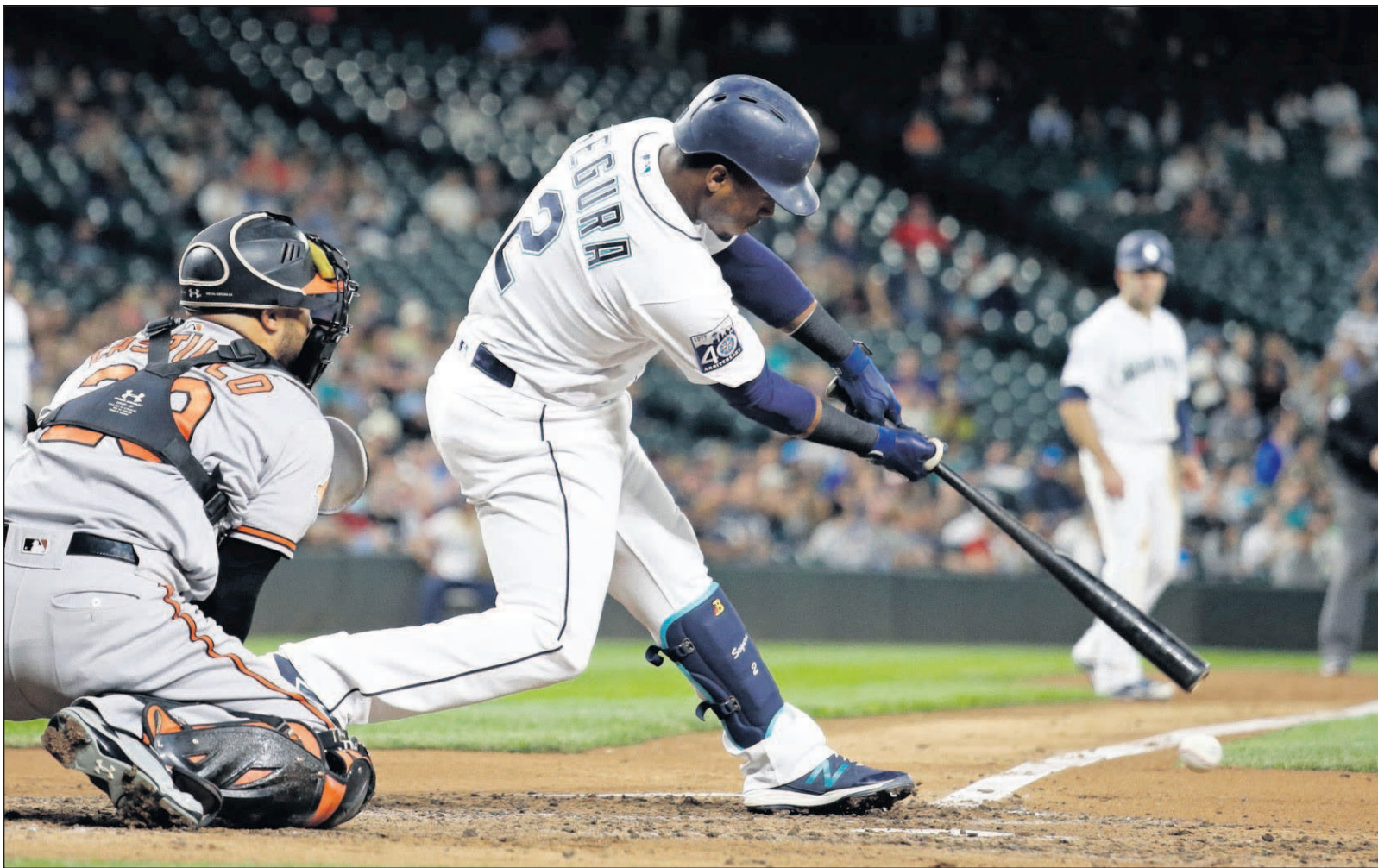
Seattle Mariners' Jean Segura (2) singles in a run as Baltimore Orioles catcher Wellington Castillo looks on in the fifth inning of a baseball game Tuesday, Aug. 15, 2017, in Seattle.