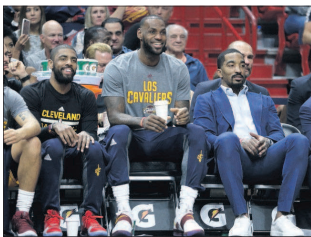
This March 4, 2017, file photo shows Cleveland's Kyrie Irving, left, LeBron James, center, and J.R. Smith, right, watching from the bench during a game in Miami.

"I think at this point, and frankly the minute we got the extra week, we could conclude the schedule