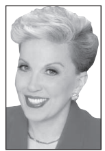
JEANNE PHILLIPS Advice