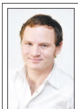
J.D. KINDLE Comment

The band name New Transit evokes an image of a semi-futuristic bus cruising down a desert highway, gleaming in the sun, and occasionally stopping to exchange riders before bolting off to its next destination. The Boise-based Americana band New Transit is much like that bus. Over the duration of its eight-year history the ridership of New Transit has shifted from album to album but the course that it initially charted as an outlet for roots music-based songwriting has remained constant.