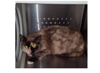
Galaxy is a 3 year old male Domestic Shorthair Mix

Available for adoption at PAWS 517 SE 3rd St. Sponsored by Pupcakes