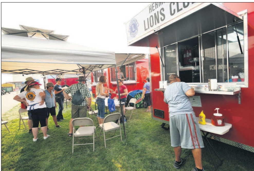
Customers place orders at the Hermiston Lions Club food cart on Thursday along the promenade at the Umatilla County Fair in Hermiston.