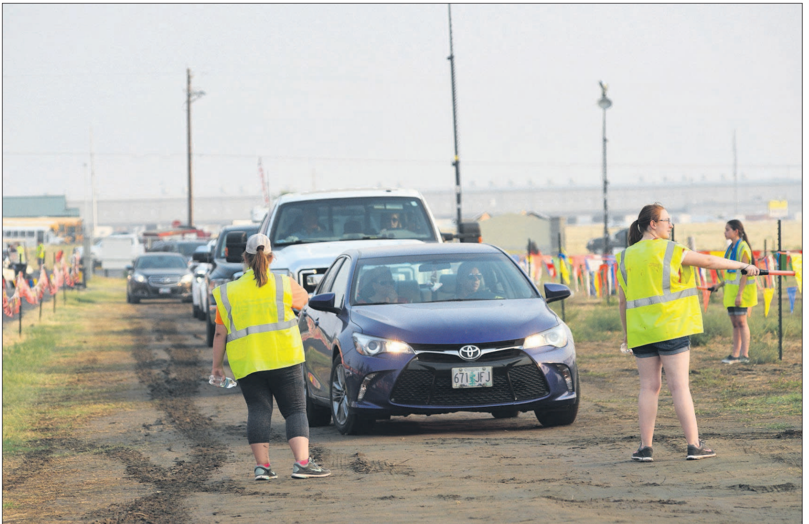
Parking lot attendants direct traffic on Thursday as the stream of cars lined up to get into the Umatilla County Fair in Hermiston increases.