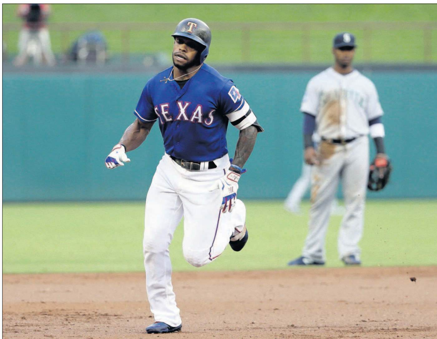
Texas Rangers' Delino DeShields rounds the bases after hitting a leadoff solo home run, as Seattle Mariners short-stop Jean Segura, rear, watches during the first inning of a baseball game, Wednesday, Aug. 2, 2017, in Arlington, Texas.