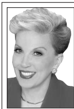
JEANNE PHILLIPS Advice

Dear Abby: My fiancé and I have been together for four years. We live together. Recently, I was talking to him about mental health and the benefits of therapy, which I firmly support. He said he thinks it's a waste of time. When I asked why, he replied that it hadn't worked for him. I asked what he meant by that (I wasn't aware that he had ever even been in therapy), and he said he went when he was 12 or 13.