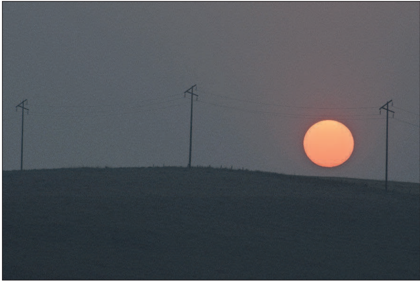
A blood-red sun dips below a set of utility wires Wednesday evening on a ridge west of Pendleton. The sun appears red due to heavy smoke from wildfires that has blown into the Columbia Basin.