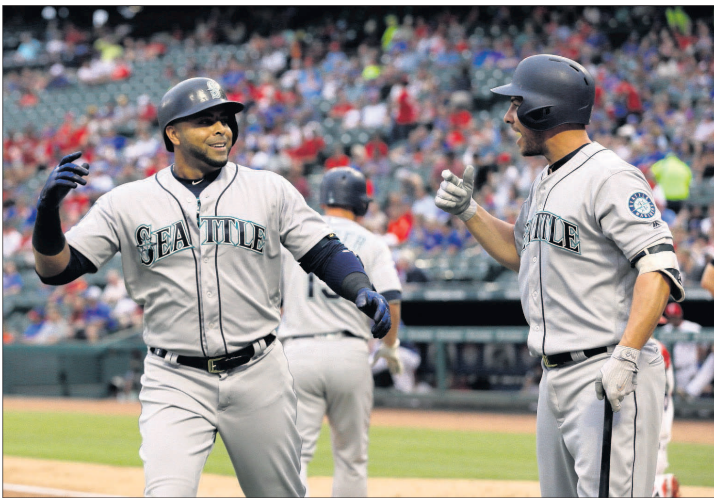
Seattle Mariners’ Nelson Cruz, left, and Danny Valencia, right, celebrate a solo home run by Cruz during the second inning against the Texas Rangers in a baseball game Tuesday, Aug. 1, 2017, in Arlington, Texas.