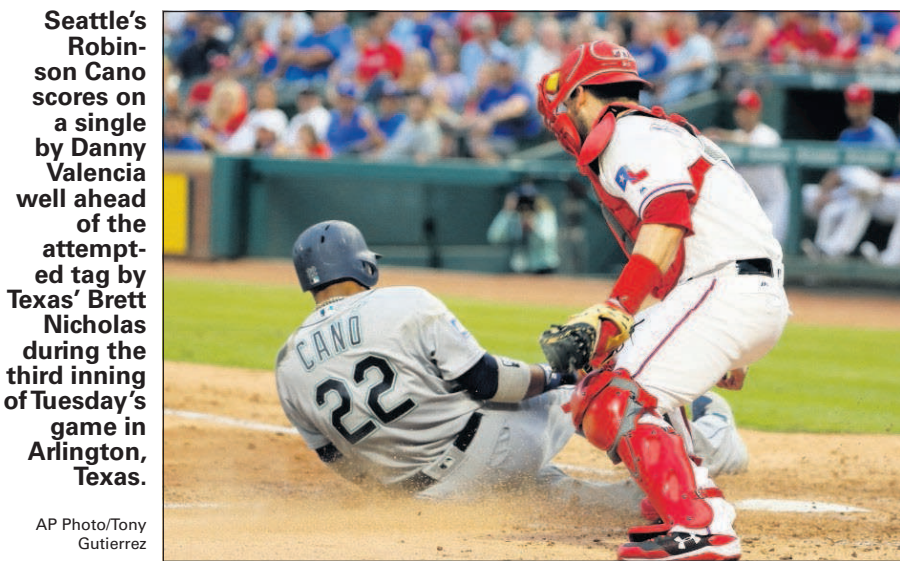
Seattle’s Robinson Cano scores on a single by Danny Valencia well ahead of the attempted tag by Texas’ Brett Nicholas during the third inning of Tuesday’s game in Arlington, Texas.