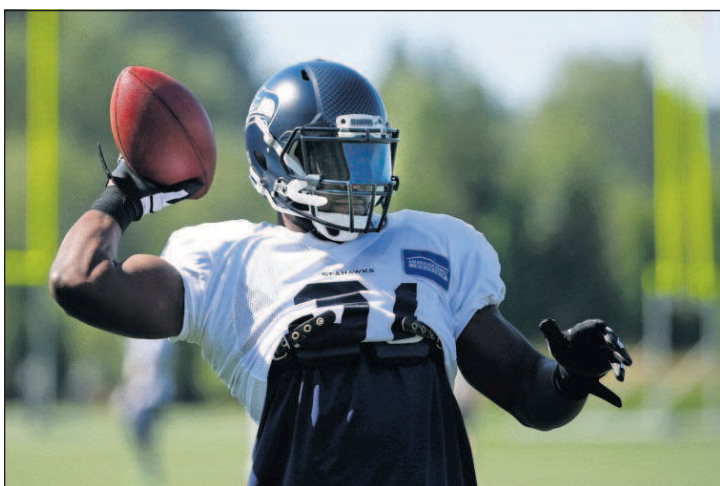
Seattle Seahawks strong safety Kam Chancellor passes the football while playing catch at the start of NFL football training camp, Tuesday, Aug. 1, 2017, in Renton, Wash.