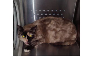
Galaxy is a 3 year old male Domestic Shorthair Mix

Available for adoption at PAWS 517 SE 3rd St.