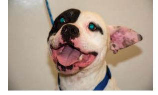
Pongo is a 1 year old male Boxer/ Dalmation Mix

Available for adoption at PAWS 517 SE 3rd St.