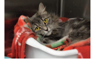
Catherine is a 1 year old female Domestic Longhair Mix

Available for adoption at PAWS 517 SE 3rd St.