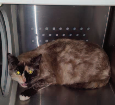
Galaxy is a 3 year old male Domestic Shorthair Mix

Available for adoption at PAWS 517 SE 3rd St.