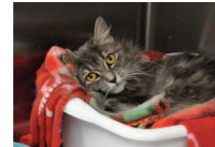
Catherine is a 1 year old female Domestic Longhair Mix

Available for adoption at PAWS 517 SE 3rd St.