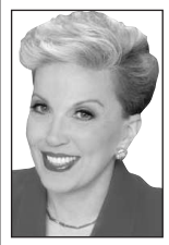
JEANNE PHILLIPS Advice

Dear Crushing: If you are crushing on your boss and fantasizing because you think she's "amazing and sexy," I beg to differ with you. You ARE ready to date.