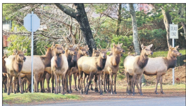
A herd of elk look both ways before crossing a street in Gearhart in 2014. notforsale