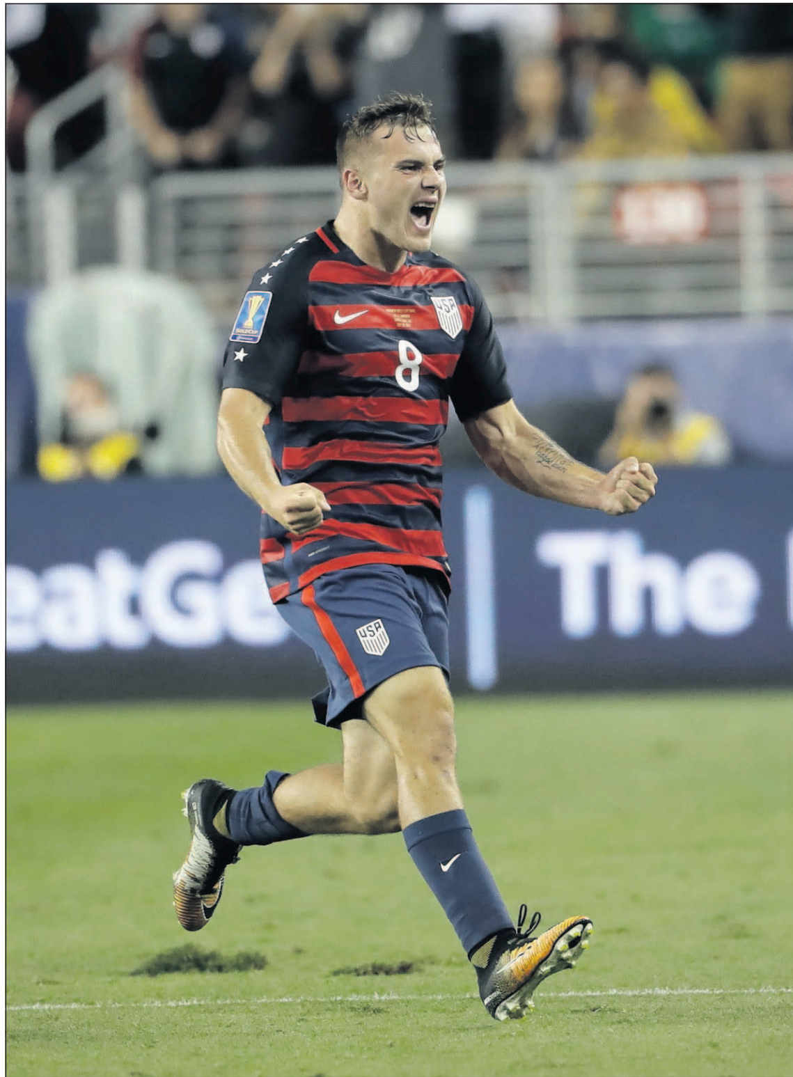
United States' Jordan Morris celebrates after scoring a goal against Jamaica during the second half of the Gold Cup final soccer match in Santa Clara, Calif., Wednesday, July 26, 2017.